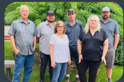
The Fairway Apartments Team