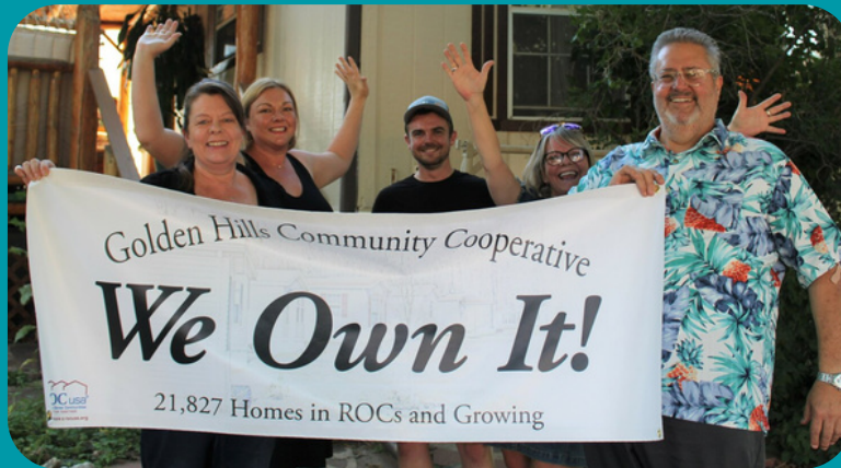
Golden Hills Community Cooperative's Board of Directors

Golden Hills Community Cooperative became the 8th Resident Owned Community in Colorado on July 11, 2023! This was the 4th attempt by the community to purchase the park, and sticking together is what made this purchase possible.